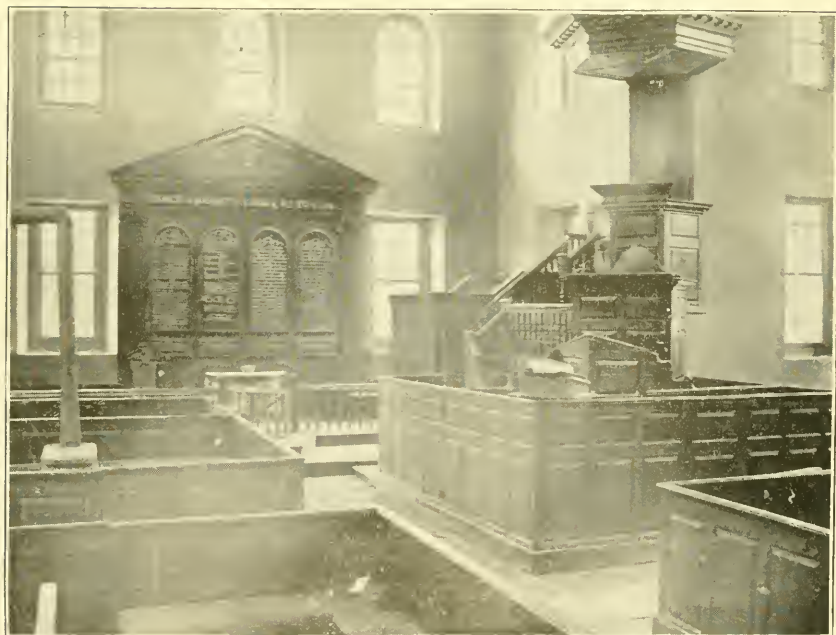
INTERIOR VIEW AQUIA CHURCH, 1899.