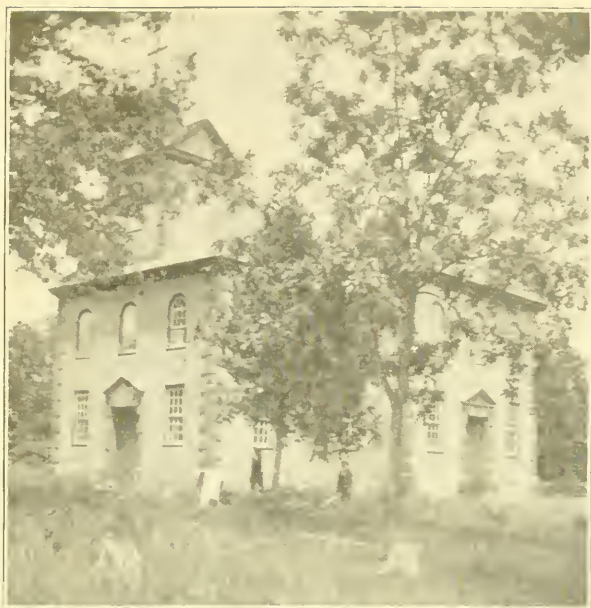
EXTERIOR VIEW AQUIA CHURCH, 1899.